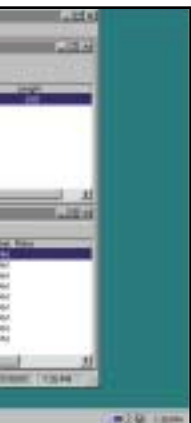
Use ViewCall Plus to manage live telephone calls from your desktop

Allows the subscriber to record incoming calls at any point during the call and save the recording to personal mailbox or forward it to another subscriber.